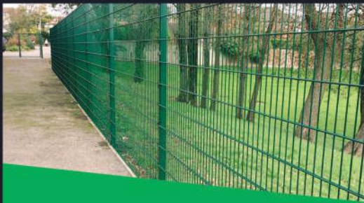
SAFEGUARDING THE DE MONFORT SCHOOL