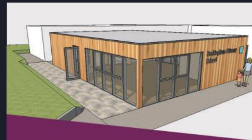
EXPANSION BUCKINGHAM SCHOOL