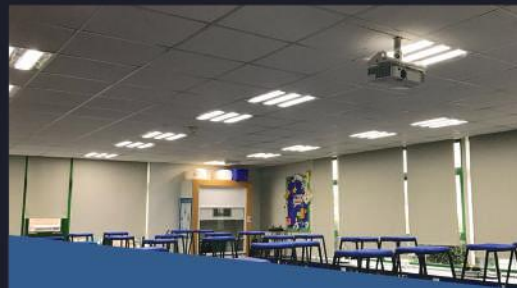
ELECTRICAL UPGRADES THE GREEN SCHOOL FOR GIRLS