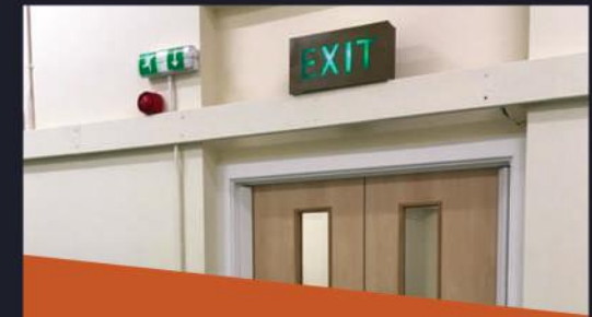
FIRE SAFETY ARNOLD ACADEMY