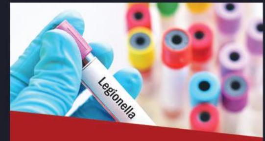
HEALTH & SAFETY SOLENT INFANT SCHOOL

www.rambuildingconsultancy.co.uk Email: VickiGilbert@ramconsultancy.co.uk Tel: 0844 335 1822 | Mob: 07590 182 584