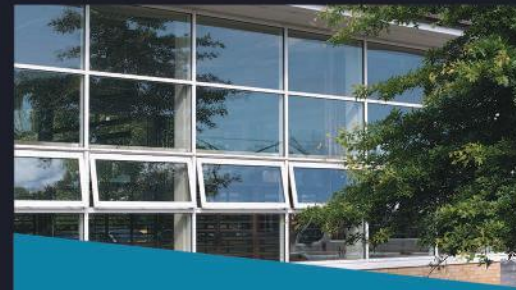
WINDOWS TRINITY HIGH SCHOOL