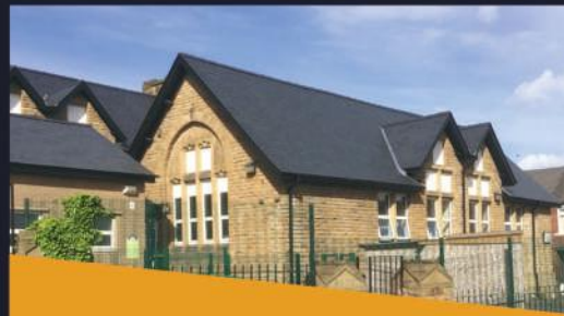
ROOFING BIRCHENSALE SCHOOL