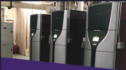
BOILERS CHEW STOKE CHURCH SCHOOL